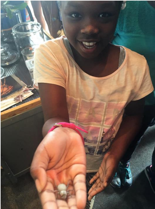
COTG participants at Natural History Museum

What is Camp-On-The-Go? Camp-On-The-Go (COTG) is a fun, educationally enriching summer camp for children in the Washington, DC area. Since 1998, we have exposed over 1,000 children to the rich culture of DC while creating a summer environment that improves and increases self-confidence and self-awareness. COTG is designed to prevent learning loss associated with long vacations, allowing campers to return to school equipped for success after a summer of exciting and engaging fun.