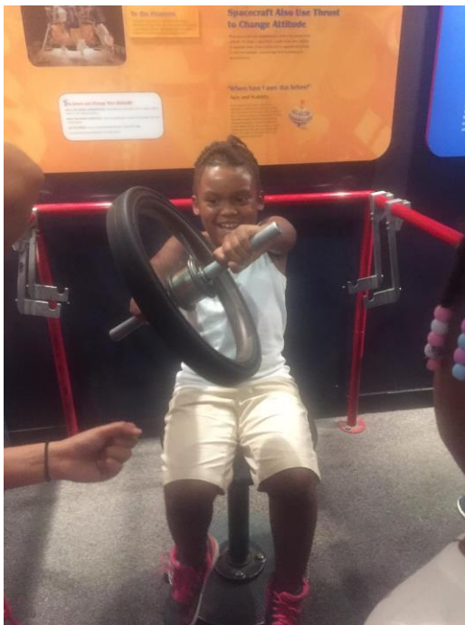
COTG participant at National Air and Space Museum