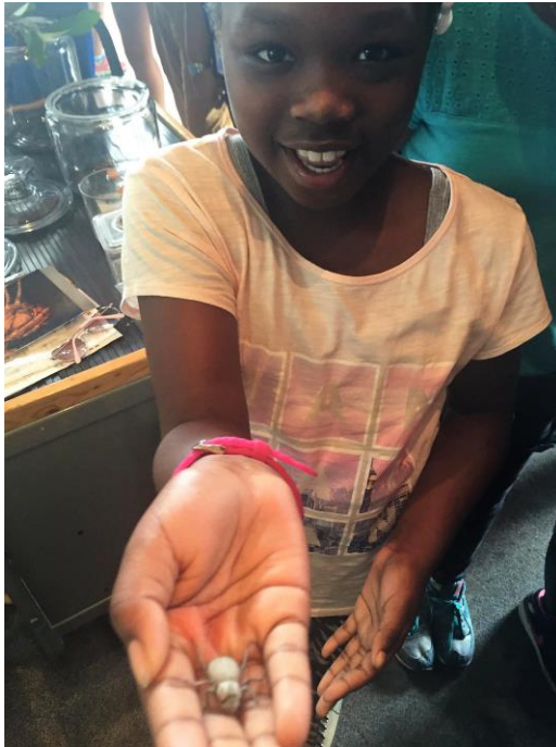
COTG participants at Natural History Museum

What is Camp-On-The-Go? Camp-On-The-Go (COTG) is a fun, educationally enriching summer camp for children in the Washington, DC area. Since 1998, we have exposed over 1,000 children to the rich culture of DC while creating a summer environment that improves and increases self-confidence and self-awareness. COTG is designed to prevent learning loss associated with long vacations, allowing campers to return to school equipped for success after a summer of exciting and engaging fun.